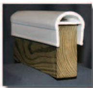
Uni-hump - 1.5" (for up-righted bunk covers)

Ready to Ship in 6' or 8' Lengths - 2 Bunkaps® Per Carton