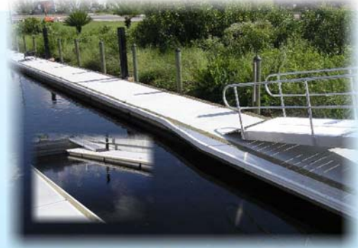
-On Marina Docks-

Our industrial grade Dry Rack and Boat Trailer/Lft Bunk Rail Covers will yield nearly a lifetime of worry-free low maintenance protection for your boating customers. Guaranteed! (10 year warranty) Used around docks, your slips and boat lifts can once again be clean and pristine while knowing that scuffing and scratching are now eliminated. Patented and Trademarked BUNKAPS® are the ultimate answer to harsh marine environments as we offer 3 popular sizes to choose from. Pure virgin vinyl BUNKAPS®.