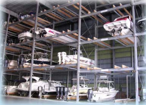
-On Dry Racks-