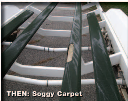
THEN: Soggy Carpet